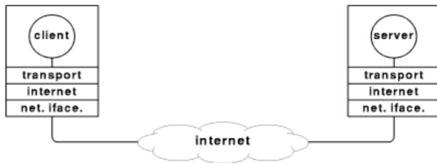
Figure 1: Client & server using TCP/IP protocols to communicate. Information can flow in either or both directions. The client & server can interact with a transport layer protocols.

A common development error is to prototype an application in a small, two-tier environment, and then scale up by simply adding more users to the server: this approach will usually result in an ineffective system, as the server becomes overwhelmed. To properly scale to hundreds or thousands of users, it is usually necessary to move to a three-tier architecture.